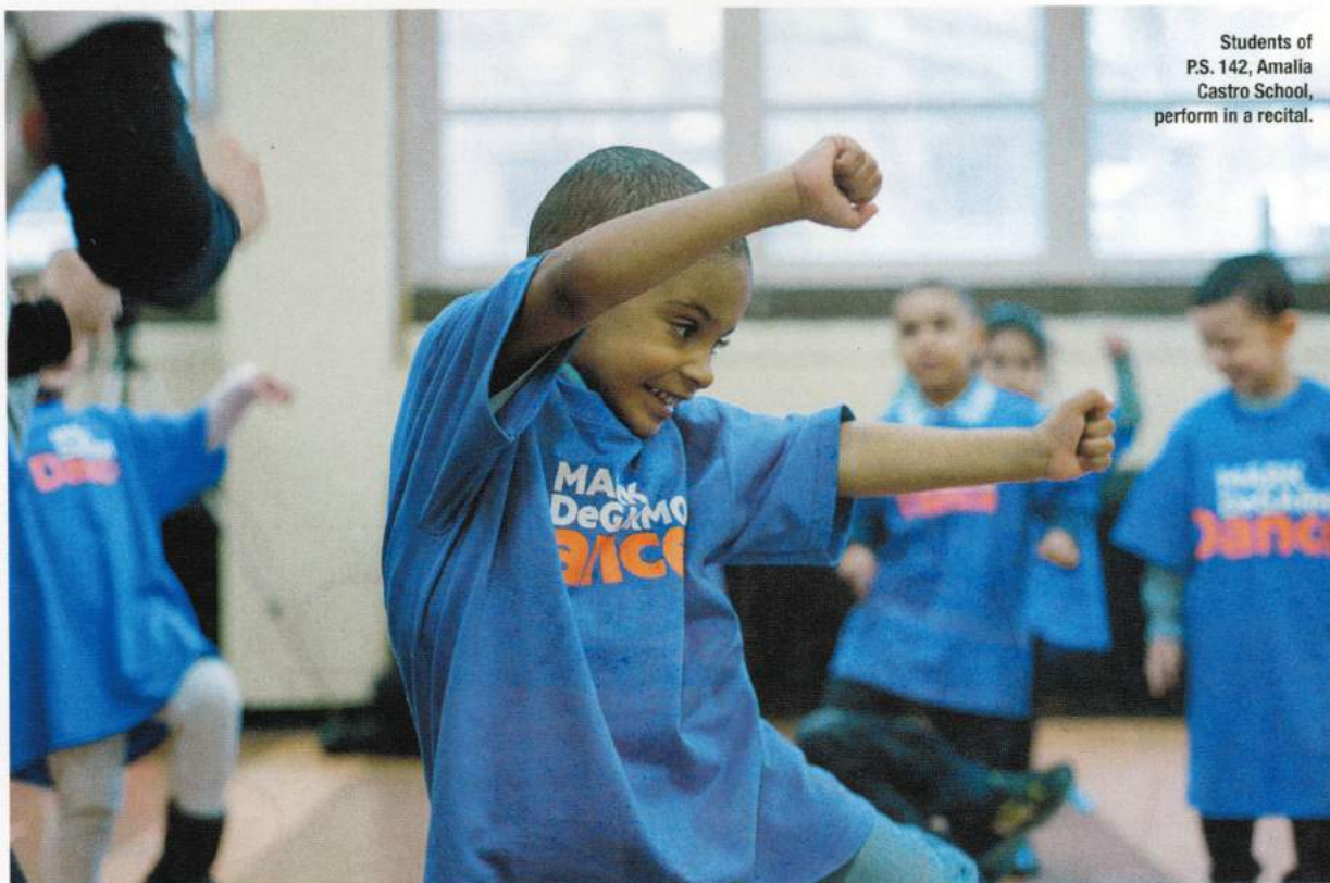
Students of P.S. 142, Amalia Castro School, perform in a recital.

“What dance does for this population of kids is to create a strong sense of self and self-esteem.”